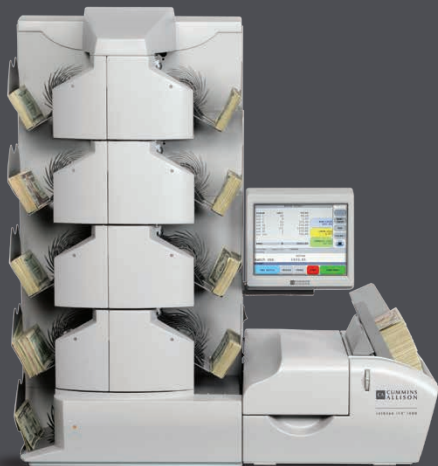
Expand to 9 pockets vertically...

Navigating to frequently used count and sort operations takes less time and effort. For even greater functionality, choose the One Touch Plus operating software to create multiple processing types, enter coin and non-cash items into batch totals, and accommodate future processing features.