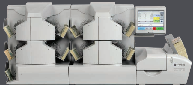
...or 9 pockets horizontally.