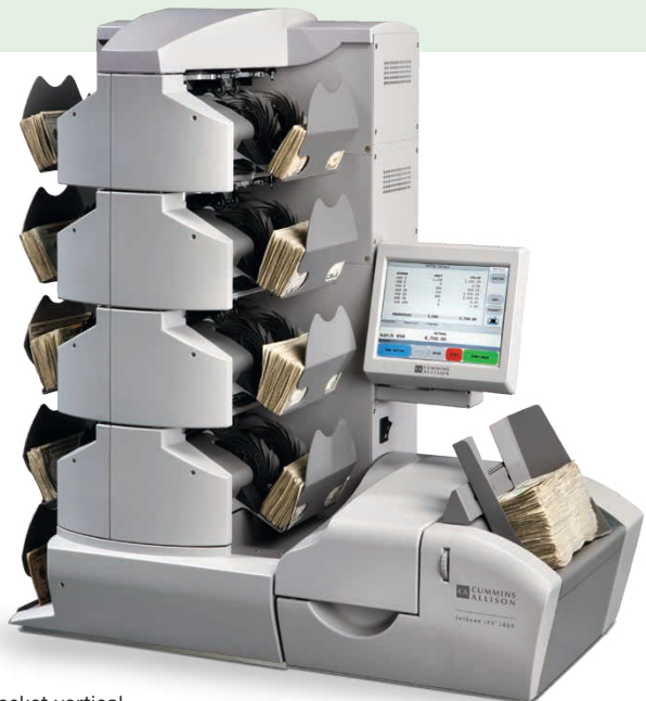
Compact 9 pocket vertical.